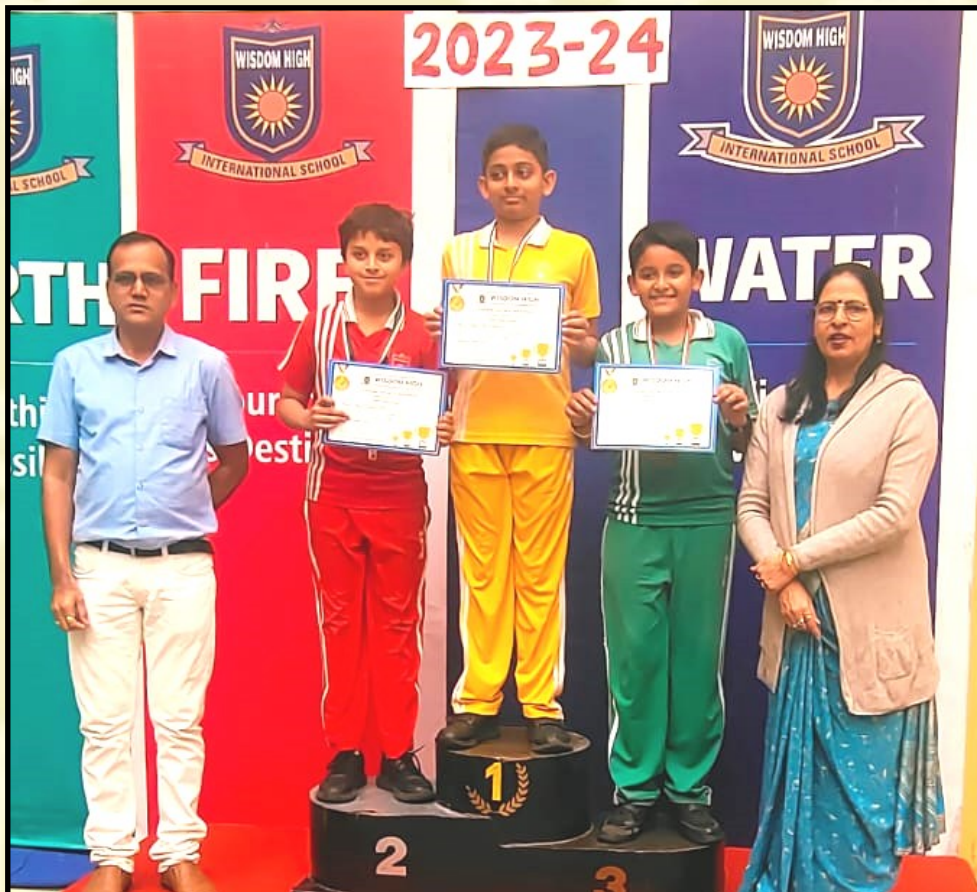
Excitement was at its peak as Grades 7-12 received sports awards , recognizing outstanding achievements and celebrating the spirit of sportsmanship at the Pre-Award ceremony!