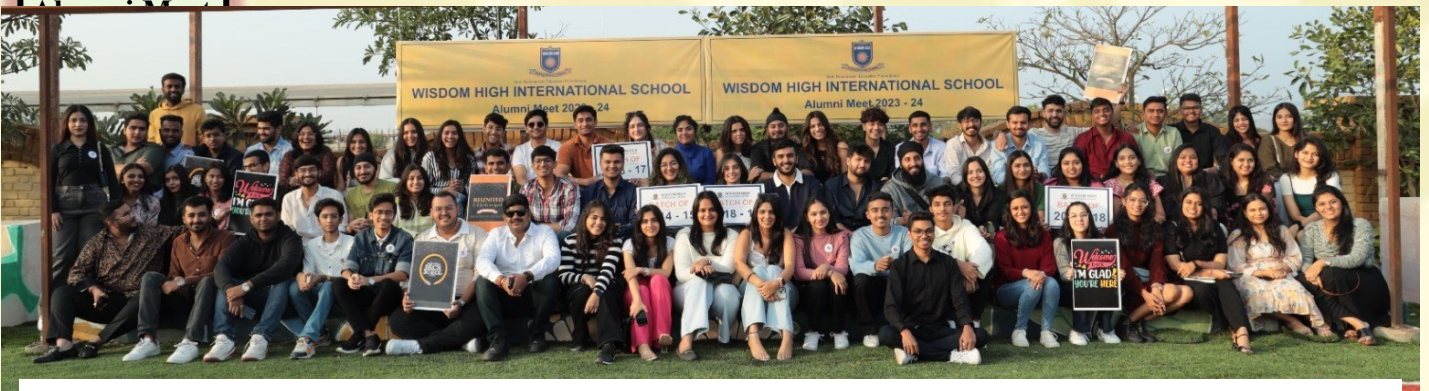
The school's Alumni Meet fostered a vibrant atmosphere, rekindling connections and providing a platform for former students to share experiences, recreate memories on the playground and classrooms. The event celebrated achievements encouraging a sense of unity.