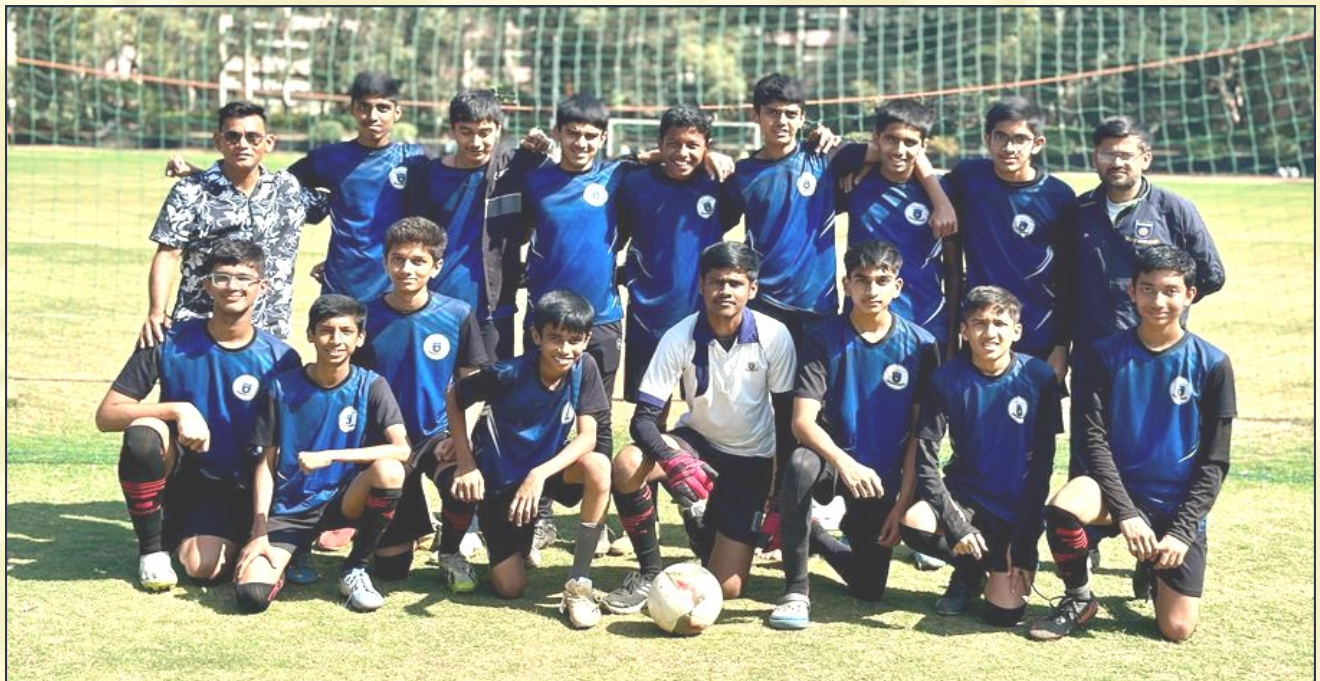
It's a proud moment for the school to announce the triumph at the FAND (Football Association of Nashik District) tournament. Our school football team under 15 boys dominated the whole tournament. Boys played one of their best tournaments. Heartiest congratulations to our school and boys.