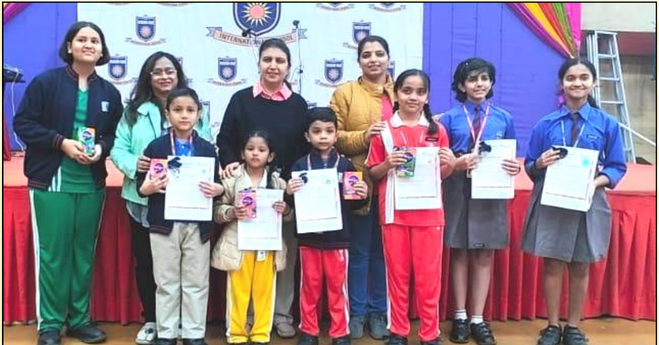
With great pleasure, the school announces the exceptional achievements of students who had performed exceptionally well in the Spell Bee Level 2 competitive exam.