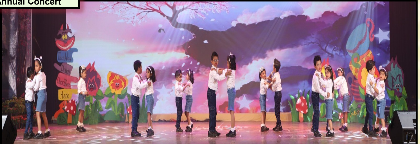
WHIS made a history by having back to back 8 shows in three days with commendable performances from all the three campuses. The themes included Peshwai, Enchanted world, The lion king, Alice in wonderland.