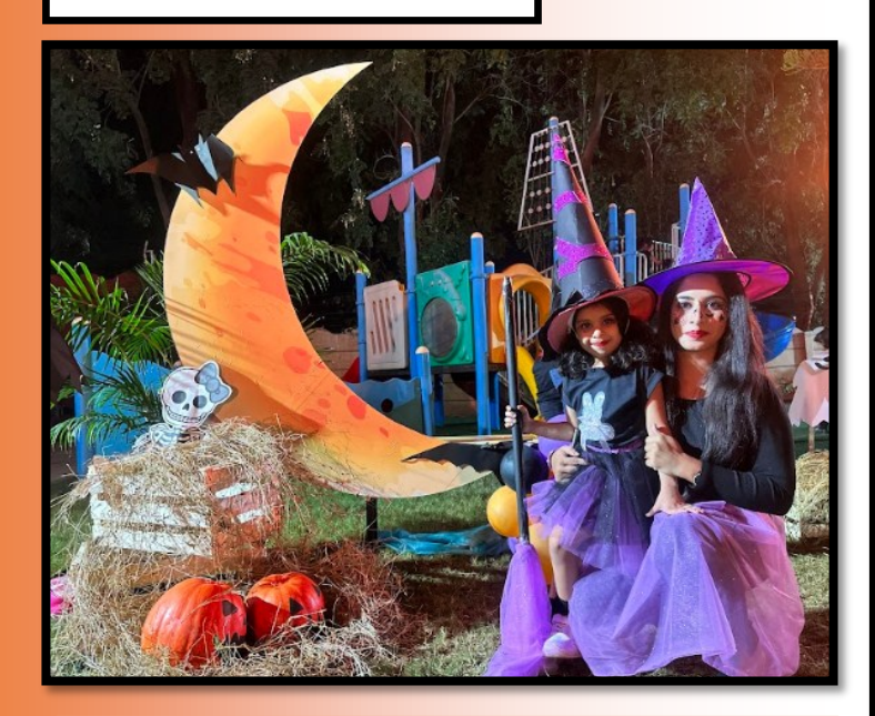
Spooky costumes ,thrilling games and sweet treats created a magical night at LWI along with their parents who enjoyed Halloween to the fullest!